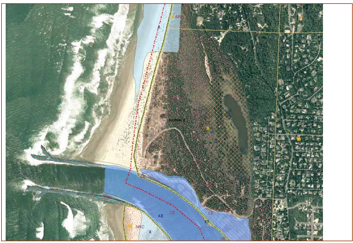
Vicinity of DMDP Site 2 - Entrance to River Mile 0.5 - Coastal Resource Management Plan zones.

• Flood Hazard Areas: Light Blue = Floodplain; Darker Blue = Floodway. (above) NWI delineated wetlands (below)